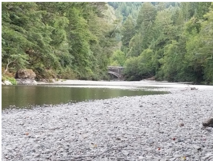
In the distance, the concrete bridge hidden in the meanderings of the Mattole River.