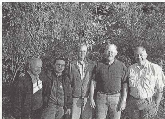
Members from Stone Church take a break from a hard days work

We have some great ideas and plans for the future and hope to share some of them next time. Meanwhile, we would like to thank all who have lent their hands and skills (both mind and body) this past year to improve our facilities. We appreciate your effort and do not take them for granted.