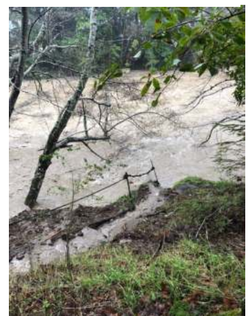
Far left shows where the spring box USED to be. It all washed down to the landing below (left), then down through the fire pit (right) THEN on down to the river! Note the rope rail ends at the top of the rock. THAT'S how high the river was!