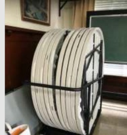
NEW (and user friendly!) tables for the Main Lodge!