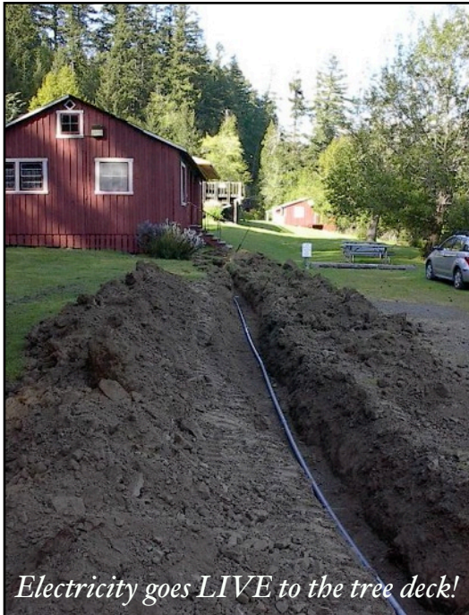
Electricity goes LIVE to the tree deck!